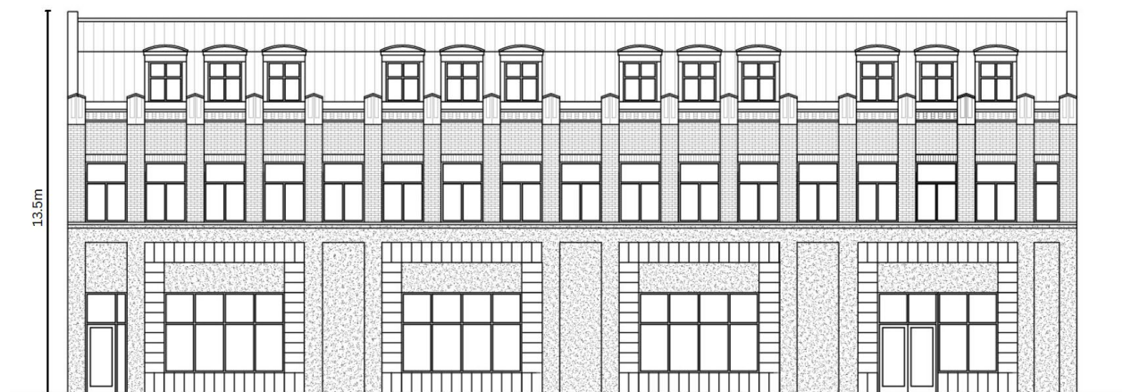
QUEEN STREET FACADE