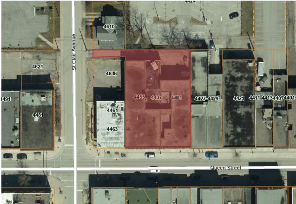
Figure 1: Subject Site, Niagara Navigator, 2023 Aerial Image