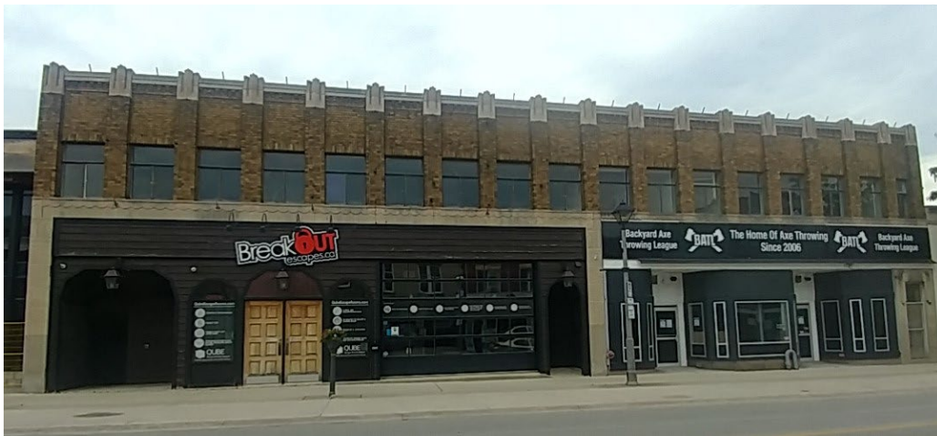
Figure 2: Existing Commercial Use, Image